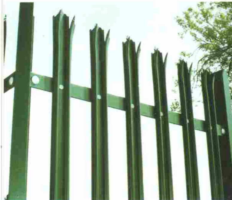
'W' Section Pale Profile