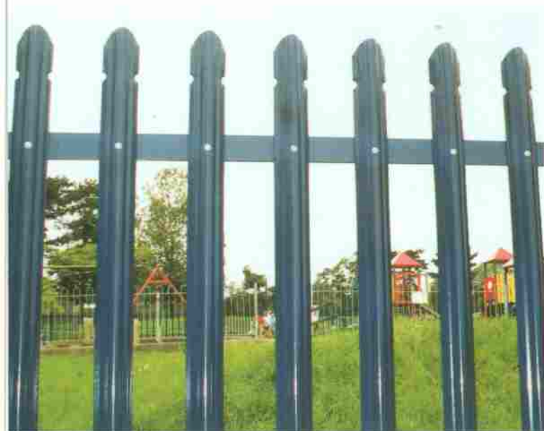
Rounded and Notched Pale Profile